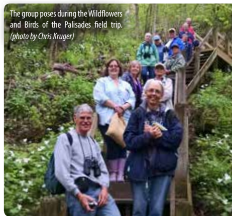
The group poses during the Wildflowers and Birds of the Palisades field trip.

Participants on our winter Olbrich trip expressed a desire to return in the summer to see the outdoor gardens. There is no fee for the outdoor gardens. For those who wish to visit the indoor Bolz Conservatory there is a $2 admission fee. The seasonal exhibit there will be "Bloom-ing Butterflies," where different species of butterflies are in various stages of development, with free-flying adult butterflies in the conservatory. We'll have lunch on the way home at the local foods cafe in the nearby village of Paoli. Call Mary to confirm your attendance.