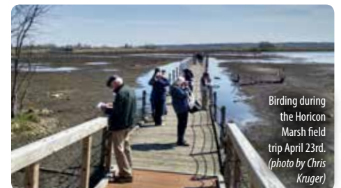
Birding during the Horicon Marsh field trip April 23rd.

If attending the potluck at 5:30, please bring a dish to pass and your own table service. The presentation will begin at 7:00 pm for those wishing to attend just the talk. There is no cost for the event.