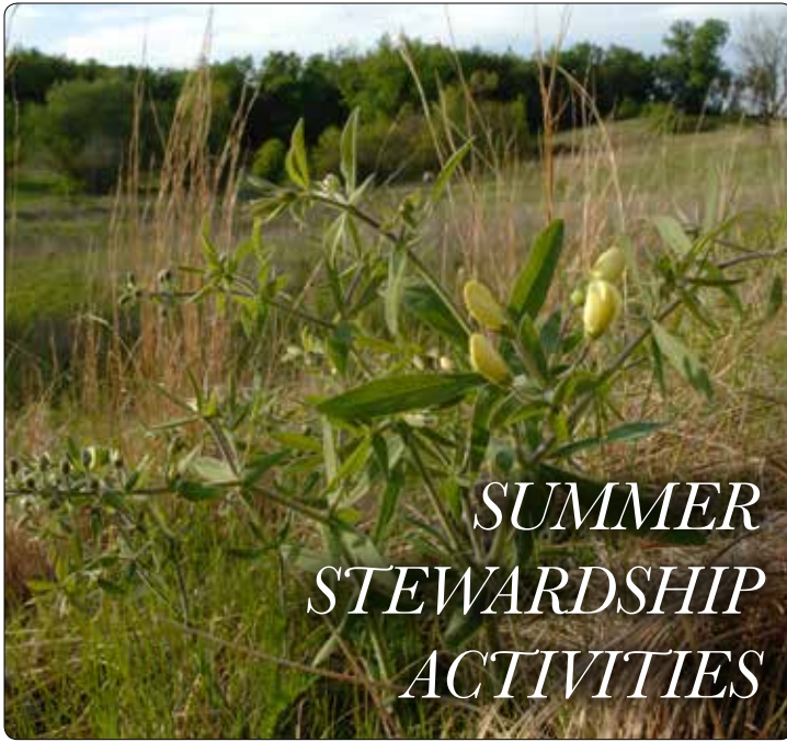
Photo: Baptisia bracteata (Cream Wild Indigo) flowering at E.C.B.P. (D. Barron)

Please join us for one or more of the following stewardship sessions scheduled below for either the Elkhorn Creek or Silver Creek Biodiversity Preserves or the Freeport Prairie Nature Preserve. Depending upon the site or week, we will be doing a variety of tasks such as removing sweet clover, burdock and wild parsnip, cutting brush, girdling saplings or otherwise reducing the competition in our native prairie, woodland and wetland remnants.