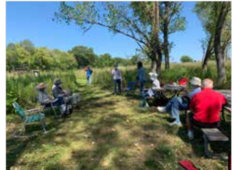
August 14th Lake Carroll Prairie Club tour attendees enjoy their lunch under a cottonwood tree.