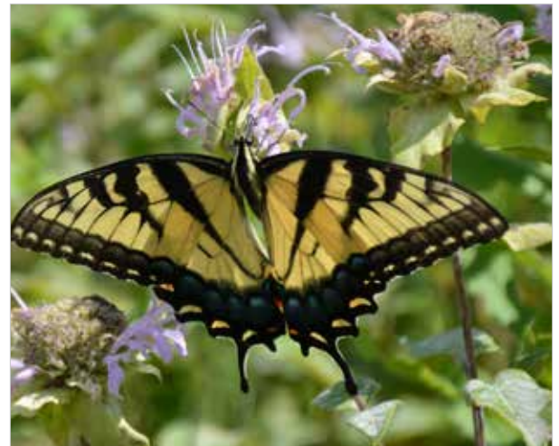
Tiger Swallowtail on Wild Bergamot ( Monarda fistulosa )

Our counters were initially puzzled by the abundance of Cabbage Butterflies, considering the non-garden habitat. However, according to the authors of Butterflies of Illinois, in addition to cultivated crucifers, caterpillar host plants can be wild crucifers, including Garlic Mustard. Since that plant experienced a banner year locally and at the preserve, we assumed that accounted for -at least in part - the explosion of Cabbage Butterflies.