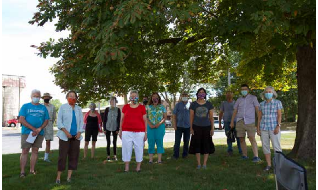
2020 Board Retreat, held August 28th in Debate Square, Freeport

Our November program will be one week later than normal (the 2nd Tuesday of the month) as November 3rd is election day (Anybody ready for this election to be over??).