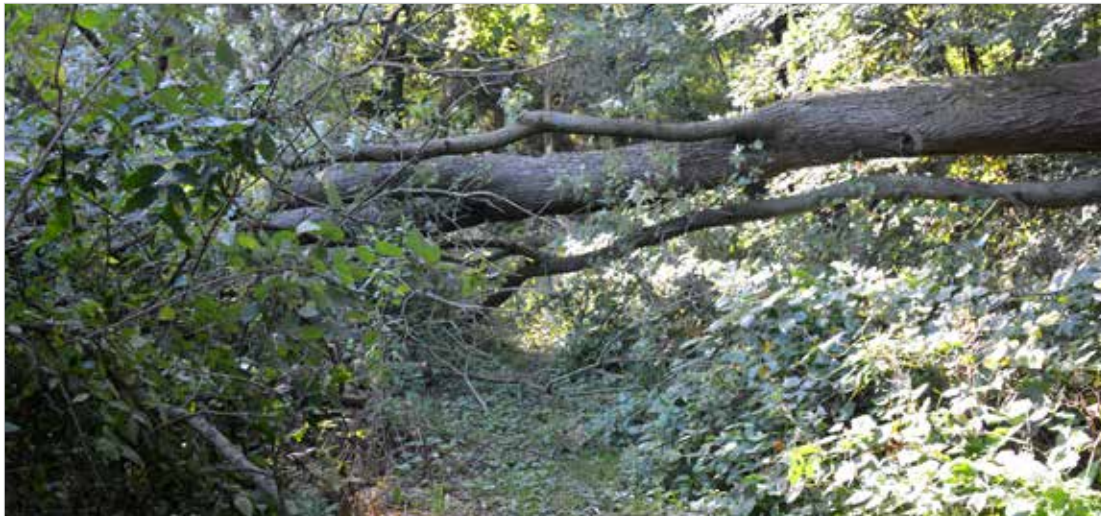
Silver Maple across a trail