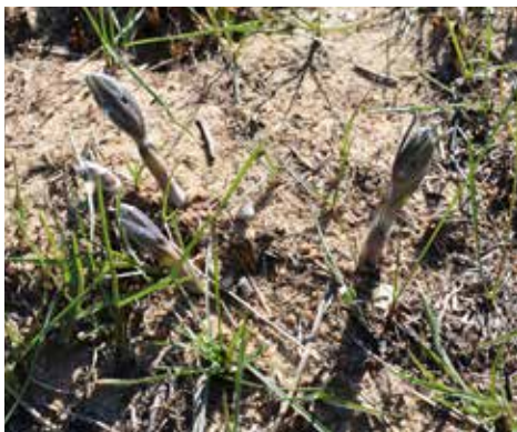
Emerging Baptisia bracteata (Cream Wild Indigo), Elkhorn Creek Biodiversity Preserve