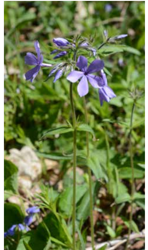
Phlox divaricata (Wild Blue Phlox)

P.S. I look forward to serving with this wonderful group of individuals. I know we had some exciting events planned over the next few months. I am sure we all understand the need for safety in our gatherings as we ride out this storm, but we will look forward to that time, hopefully in the not too distant future, when we can gather again as a group for a variety of activities, projects and learning experiences. In the meantime stay tuned to the website for any news on upcoming events, but more importantly take this time now to get outside and enjoy the spring migration which is just beginning to ramp up. Take care and stay safe. Gary G.