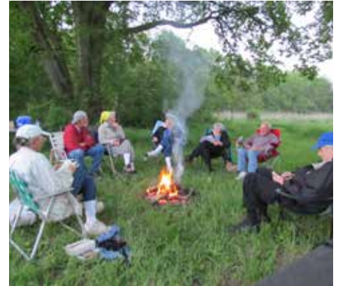
NIAS Sponored campfire held at Silver Creek Biodiversity Preserve

If our Stay-at-Home directive is lifted we plan to have our usual summer campfires, but not in our usual manner. Check our website for the latest information. We will assume that social distancing will continue and that groups will be limited to 10 people, so we will expand our campfire circle accordingly.