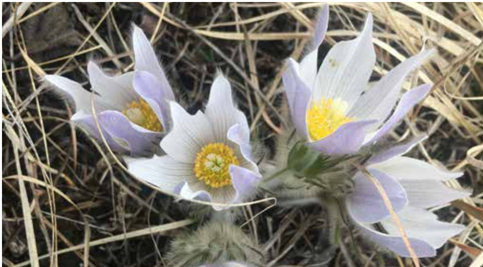
Anemone patens (Pasque Flower)