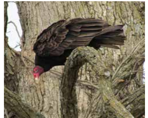
Turkey Vulture | by Anne Straight