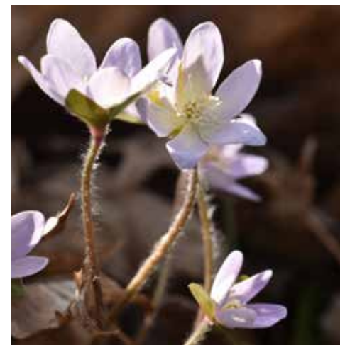
Anemone acutiloba (Sharp-lobed Hepatica)