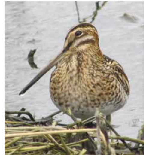
Wilson's Snipe