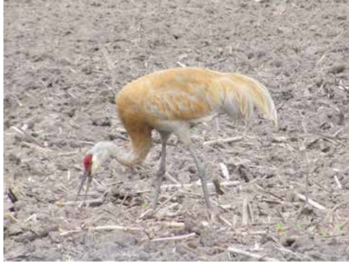
Sandhill Crane | by Juliet Moderow

species. Mary also observed the pelicans feeding cooperatively by using their bills to scoop water. Typical cooperative feeding for pelicans would be for the pelican to scoop water in front of them but these birds were scooping water to the side of them