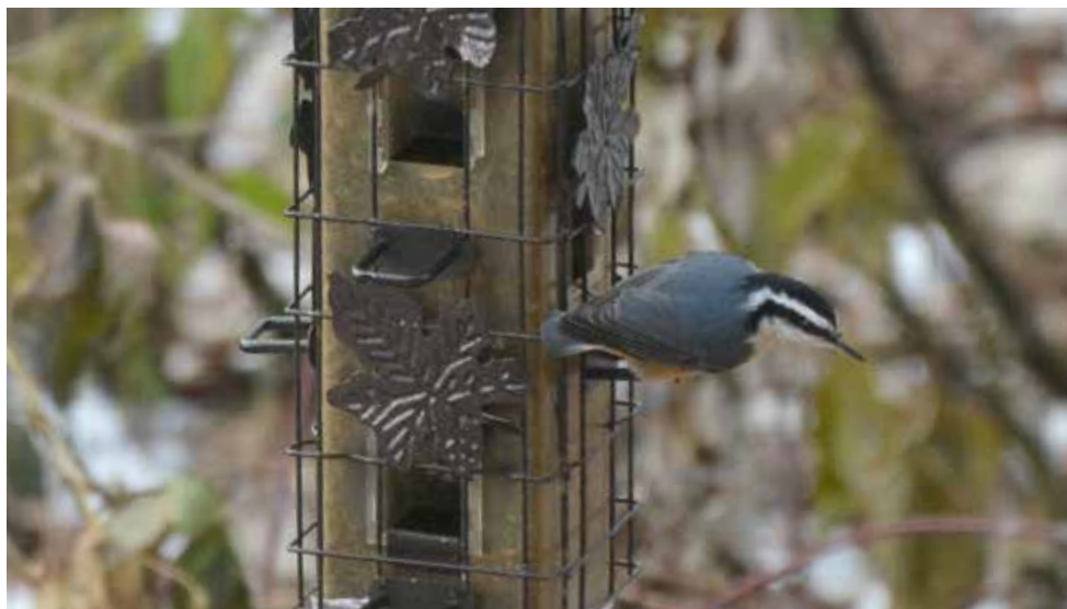
Red-breasted Nuthatch