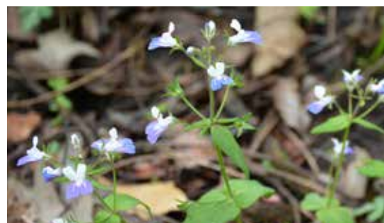
Blue-Eyed Mary Collinsia verna