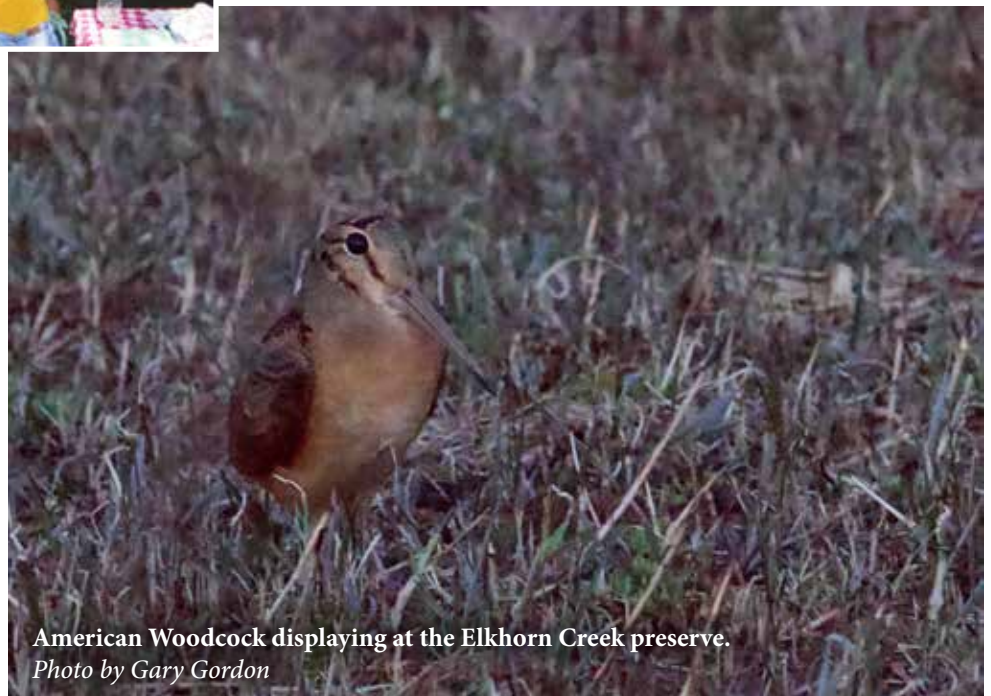
American Woodcock displaying at the Elkhorn Creek preserve.