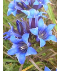
Prairie Gentian Gentiana puberulenta

plants are seeds in the ground waiting for fire to the seed harvesting time in the fall. I also really like learning new things about nature and the volunteers at the preserve are a wealth of knowledge (and they are happy to share that knowledge.) What a great group of people!"