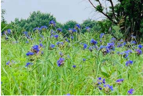
Spiderwort blooming at ECBP June 19th