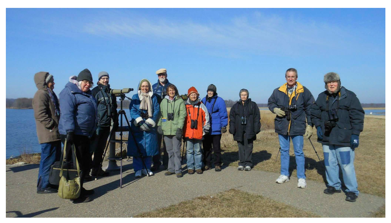
Spring waterfowl field trip to Spring Lake in 2015

He oozed green slimy stuff all over my fingers. I ran into the house screaming.