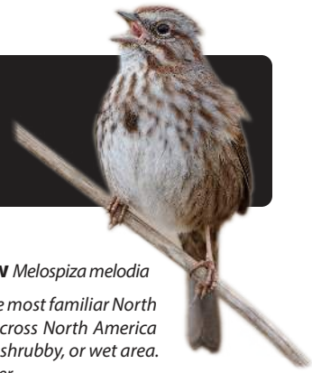
Song Sparrow Melospiza melodia

A chapter of the National Audubon Society