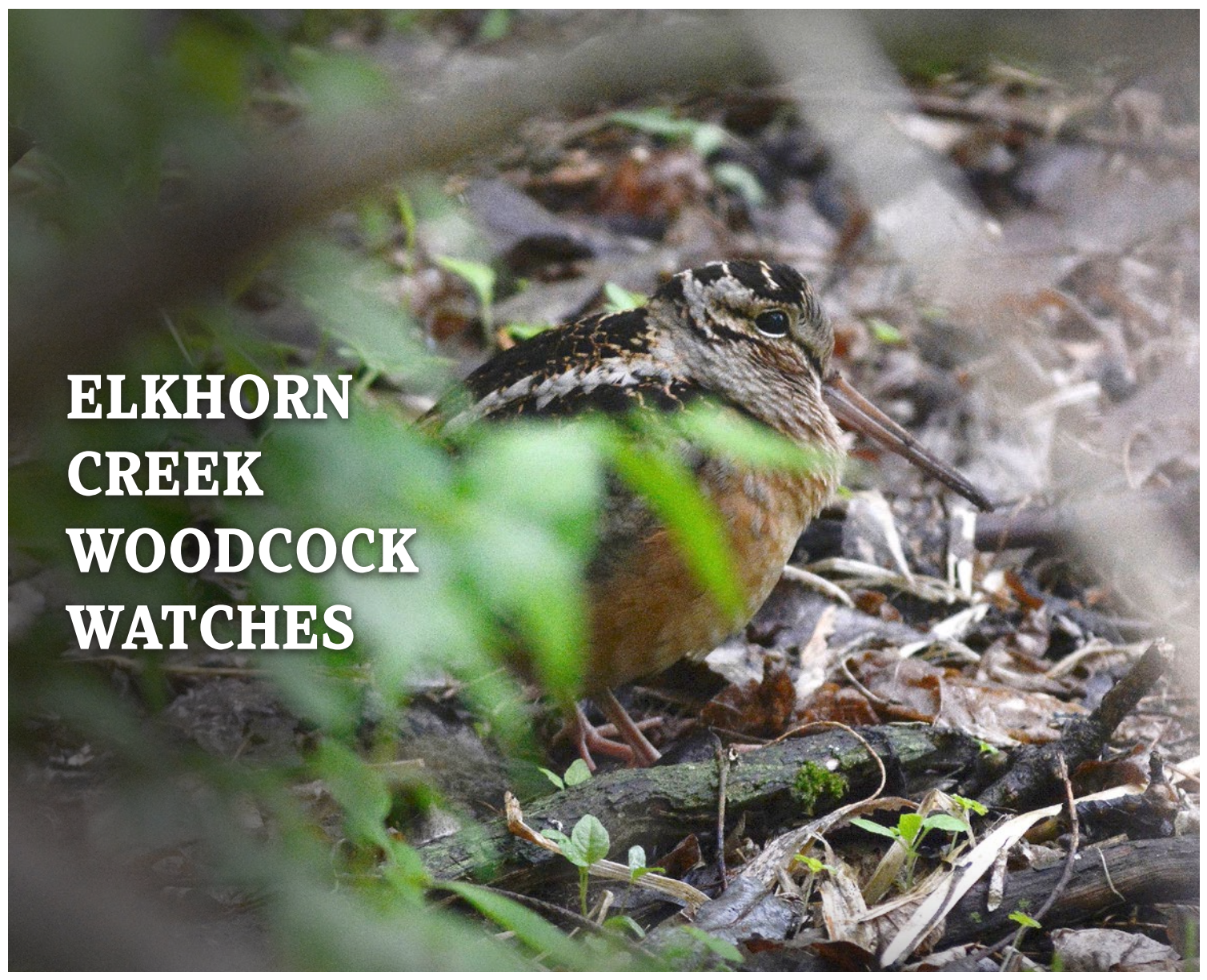
American Woodcock