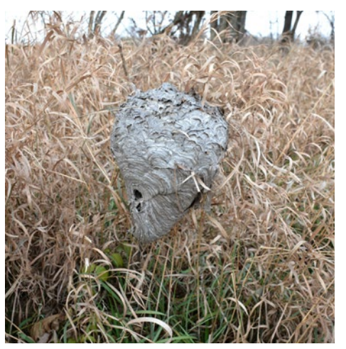
▶ LOWEST: At our Silver Creek Biodiversity Preserve, inches from the ground, this nest was built on a small Black Walnut sapling that was only a foot or two off the trail.