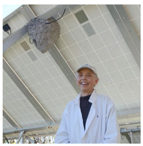
▶ LOWER: This nest was built on the back of one of Mary Blackmore's solar arrays. The photo was taken in November after the nest was abandoned.