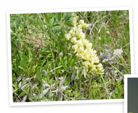
▲ Blooming Cream Wild Indigo at Elkhorn Creek