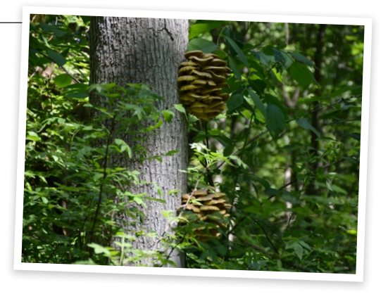
▲ Awesome Fungi at Silver Creek, possibly Sulphur Shelf or Chicken of the Woods Mushroom

Baskina Common Whitetail dragonfly at Silver Creek ▶