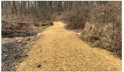
New culvert at SCBP