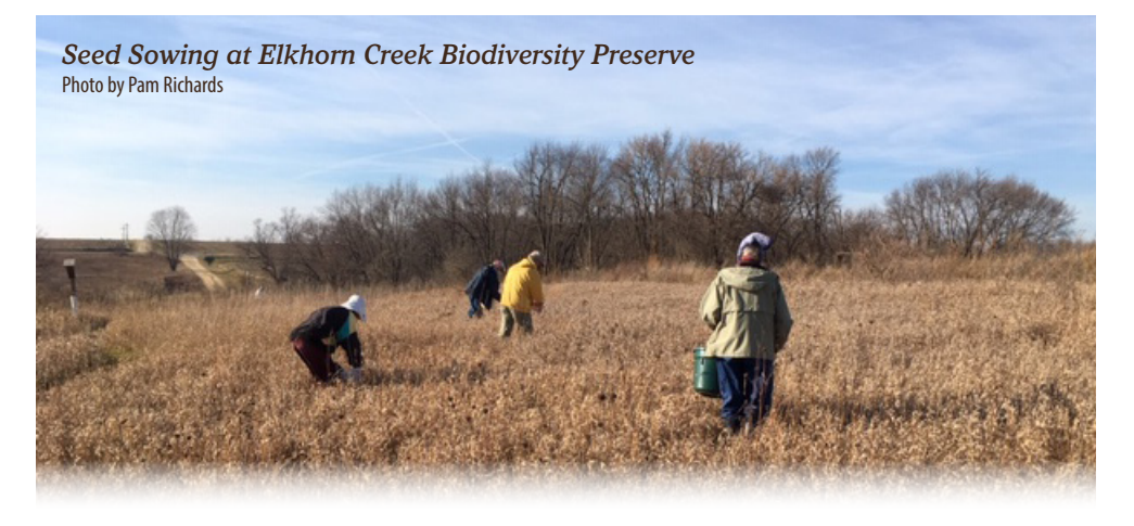
Awesome Auduboners still at it, December 10th, 2020

Now that NIAS is using Zoom for special events and programs, please contact Juliet Moderow at nwilaudubon@gmail.com or 815-599-3578 if you need instructions on how to use Zoom.