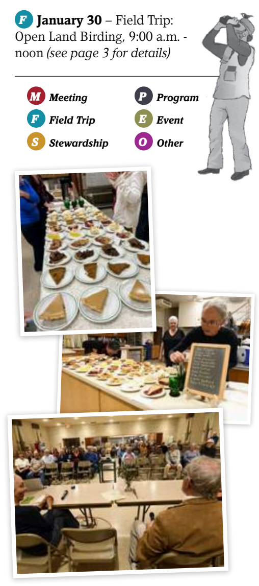
November 6th – NIAS 50th Anniversary Program

F January 13 – Field Trip: Open Land Birding, 9:00 a.m. - noon (see adjacent column for details)