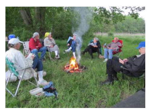
NIAS Spondored campfire held at Silver Creek Biodiversity Preserve

Northern Flickers are large, brown woodpeckers with a gentle expression and handsome black-scalloped plumage. On walks, don't be surprised if you scare one up from the ground. It's not where you'd expect to find a woodpecker, but flickers eat mainly ants and beetles, digging for them with their unusual, slightly curved bill. When they fly you'll see a flash of color in the wings – yellow if you're in the East, red if you're in the West – and a bright white flash on the rump.