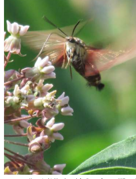
Hummingbird hawk-moth feeding on Common Milkweed