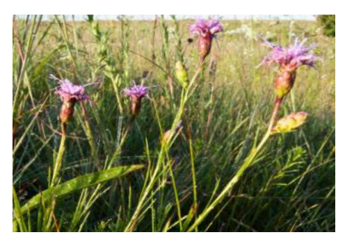
Liatris cylindracea (Cylindric Blazing Star) "taken at Harlem Hills in August's past."

Enjoy a YouTube presentation hosted by the staff of Severson Dells Nature Center at Harlem Hills Prairie in all its glory of late summer. This gravel prairie contains a large number of plant species, including several that are threatened or endangered in Illinois. Harlem Hills