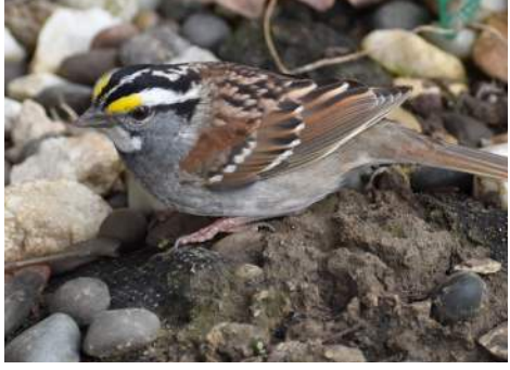
White-throated Sparrow

The study, published in the journal Wildlife Research and funded by the National Environmental Science Program, analyzed data from more than 60 studies on cats. Rather that rely on the traditional method of conducting cat studies, which meant analyzing the stomachs of cats that had been killed, this one used GPS trackers, video collars, scat analysis, and owner surveys to create a more detailed picture.