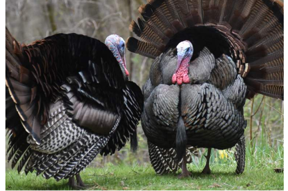
Wild Turkey

If you can volunteer to help sort orders or deliver seed, please call 815-238-9259 or 815-938-3204.