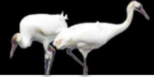
Whooping Crane Grus americana

A chapter of the National Audubon Society