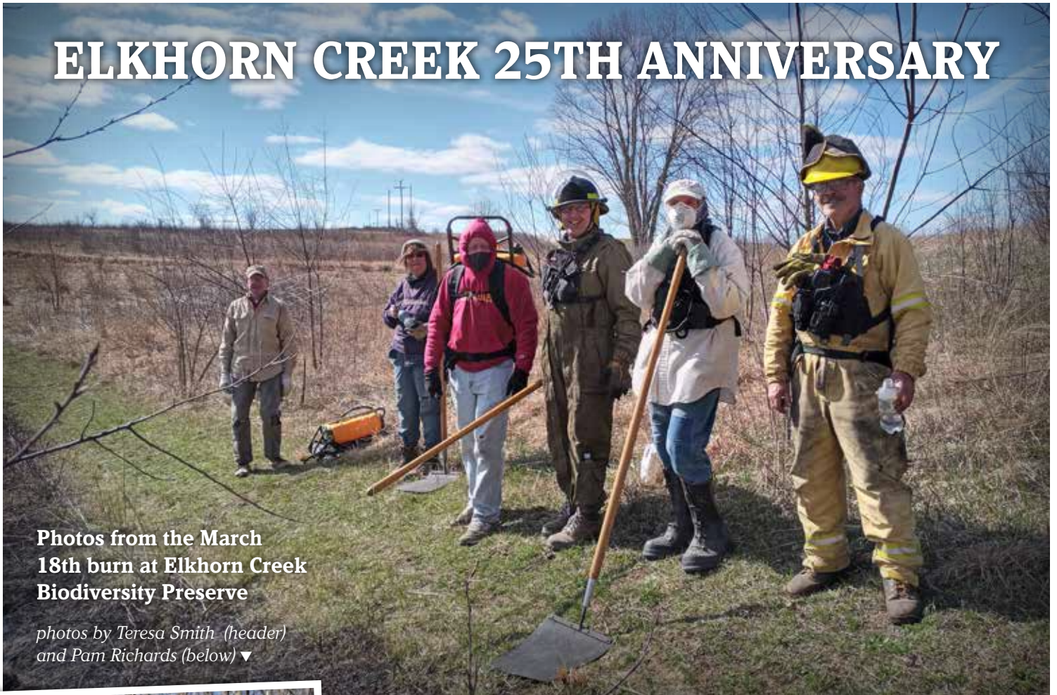
Photos from the March 18th burn at Elkhorn Creek Biodiversity Preserve