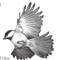
Drawing by Carol Litus